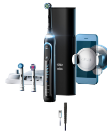
Oral-B 8000 Electronic Toothbrush, Black, Powered by Braun