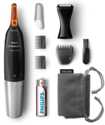
Philips Norelco Series 5100, Nose, Eyebrow and Ear Trimmer, NT5175/49