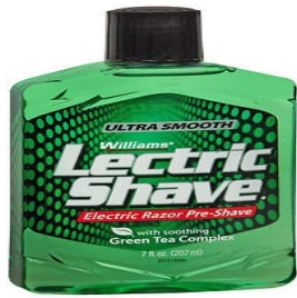
Williams Lectric Shave, Electric Razor Pre-Shave, With Soothing Green Tea Complex, 7 Fluid Ounce Bottle